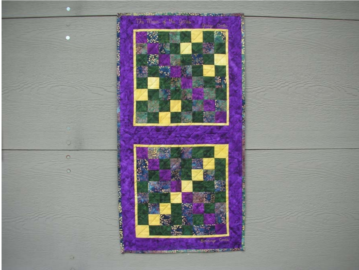
Figure 2c. “The Music of the Genes”. A quilt pattern by Elaine Ellison.

Notice that in M_2 the natural numbers 4,6,9 appear while in M_3 the natural numbers 8, 12,18, 27 appear, with each row and column having the same sequence of positive integers with no integer appearing adjacent to itself in a row or column. These sequences come from a triangle of numbers attributed to the 2 nd century AD Syrian mathematician Nicomachus (Kappraff, 2000) and represent successive sequences of musical fifths. The Nicomachus Triangle, T(n,k) , is reproduced in Table 1 where the integers in the n -th row are \{2^{n-k}3^k, 0 \leq k \leq n\}; n \geq 0 . Here if the central integer 6 is thought to be the length of a string representing a fundamental tone, then 4 and 9 of row 3 represent the string lengths corresponding to rising and falling musical fifths, ratios of 2:3 and 3:2. Also the fifth row represents the string lengths that give rise to a pentatonic